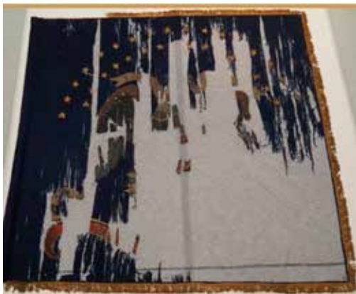
Remnant of battle flag

The fortunes of war were such that the 12th Infantry did not meet the enemy on as many fields of battle as did some of its comrade organizations, but it performed faithfully all the duties entrusted to it, and its record from first to last was a credit to its members and to the State. The losses of the 12th during its term of service numbered four hundred and thirty-two deaths by disease and in battle, this being the largest death-record of any Michigan regiment excepting only the 6th Infantry, in which the corresponding loss was five hundred and forty-two.