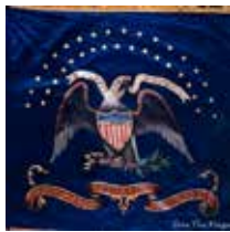
BERRIEN COUNTY MEMBERS OF THE TWELFTH INFANTRY.

The fortunes of war were such that the 12th Infantry did not meet the enemy on as many fields of battle as did some of its comrade organizations, but it performed faithfully all the duties entrusted to it, and its record from first to last was a credit to its members and to the State. The losses of the 12th during its term of service numbered four hundred and thirty-two deaths by disease and in battle, this being the largest death-record of any Michigan regiment excepting only the 6th Infantry, in which the corresponding loss was five hundred and forty-two.