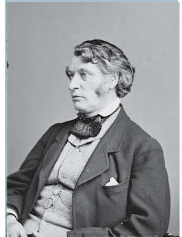
Charles Sumner (January 6, 1811 – March 11, 1874)