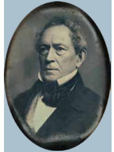
Edward Everett (April 11, 1794 – January 15, 1865)