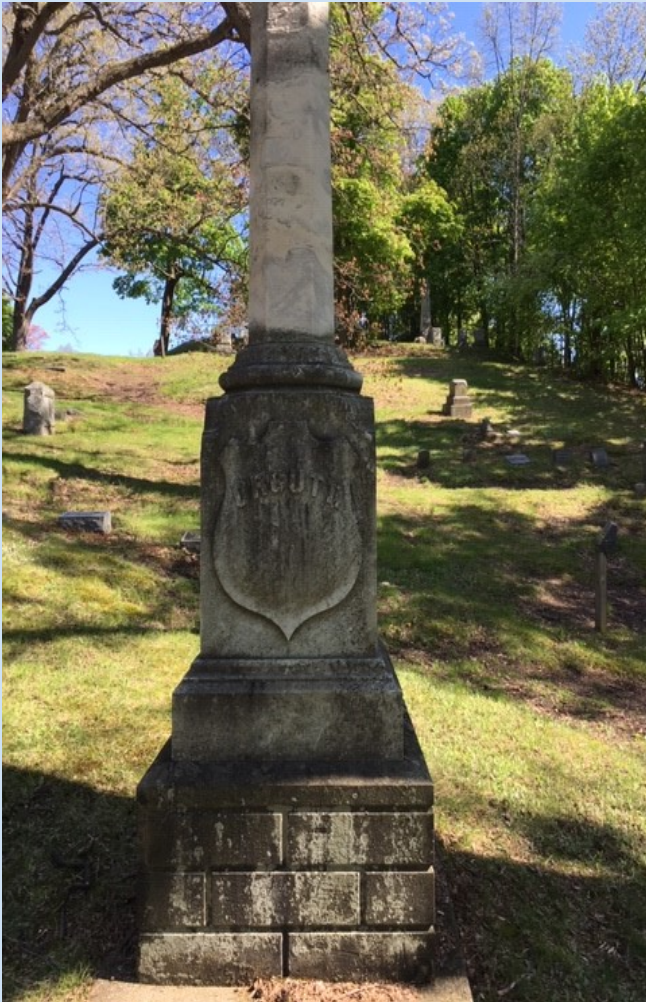
Orcutt monument prior to cleaning. Pollutants have deeply penetrated the stone.

Buried in the Mountain Home Cemetery, Orcutt's monument and gravestone sit facing W. Main Street and have been exposed to 150 years of auto exhaust and other road and neighborhood pollutants. His marble monument was created with a limestone base and both definitely show the effects of age and pollution. It was apparent that this would be very difficult to clean as the stains were deeply imbedded in the stone, yet we wanted to avoid significant surface brushing to avoid eroding the stone any more than time and weather have already accomplished. Ultimately, we were forced to try the poultice method for removing most of the worse stains.