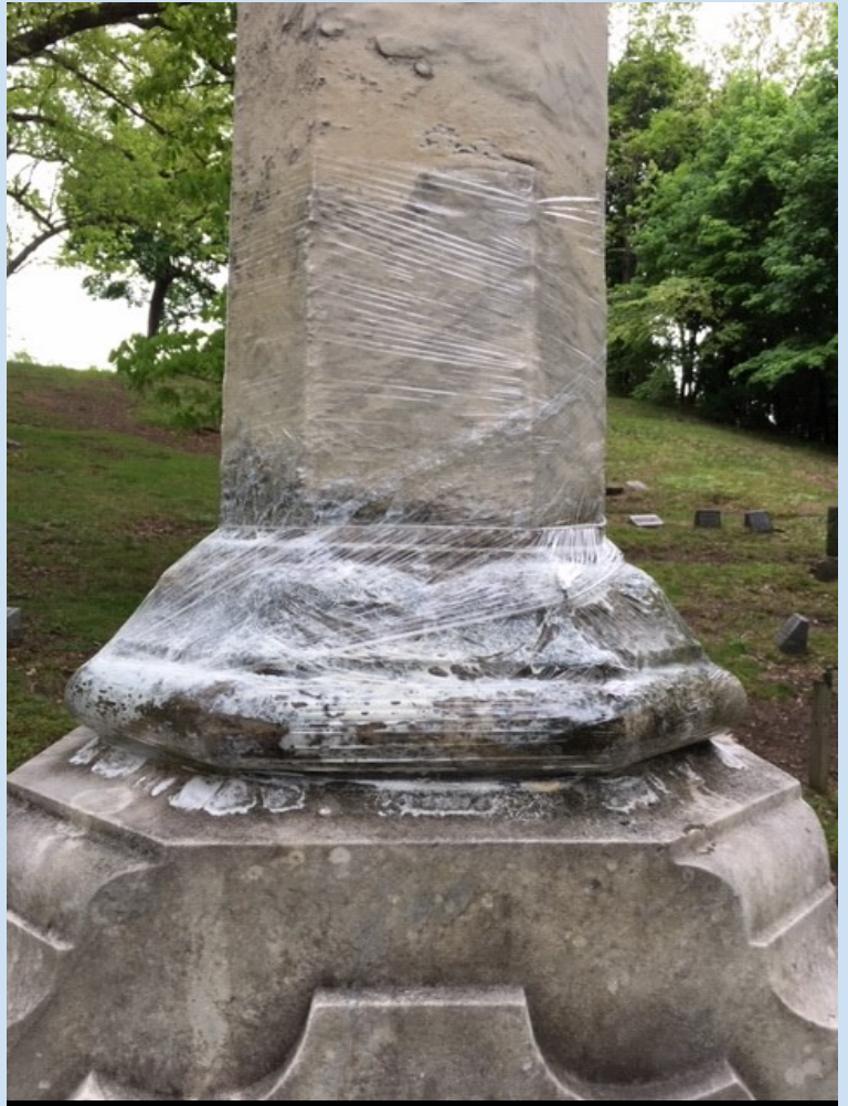
Some areas of the monument were so deeply stained black that they defied cleaning, so we created a poultice from Orvus Paste, wrapped it with plastic wrap, and recleaned it after waiting for 24 hours.