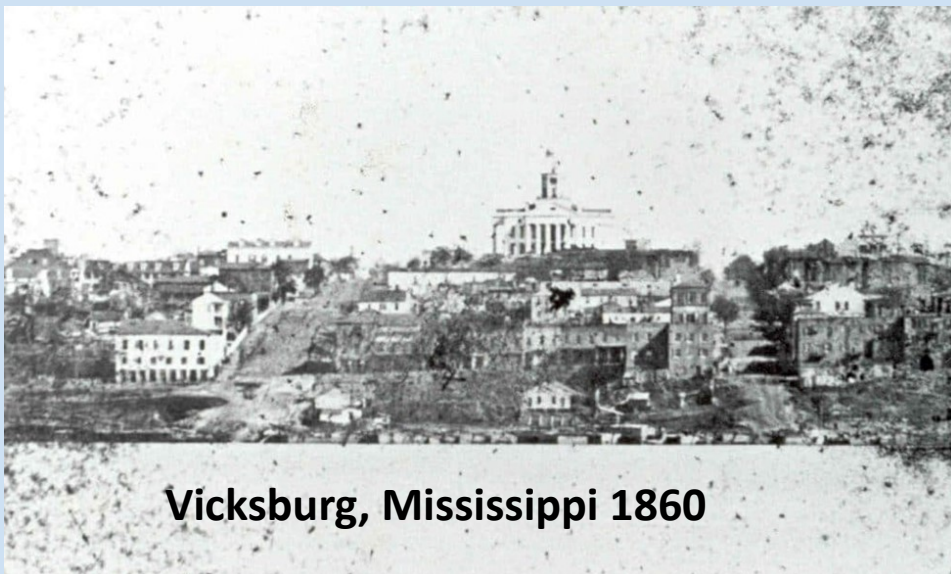
Vicksburg, Mississippi 1860

On July 4th, 1863 the Battle of Gettysburg had been over for a day when Union General Ulysses S. Grant notified President Lincoln that Vicksburg, Mississippi had surrendered its last bastion on the Mississippi River. Strategically, even more important than Gettysburg, Vicksburg was an important rail hub and a bastion controlling the bluffs overlooking and controlling traffic on the Mississippi. Grant's conquest of Vicksburg split the Confederacy in half, allowed complete control and usage of the Mississippi River to the Union and captured over 30,000 Confederate troops.