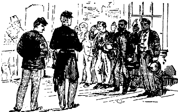
Organizing a new Camp

If our recruiting efforts are to be effective, it is evident that each Brother in the process must fulfill his responsibilities. Whether manning a recruiting tent, forwarding notifications to Camps, or a Camp officer handling recruitment; all must do their sworn duty if the Order is to continue to grow and prosper.