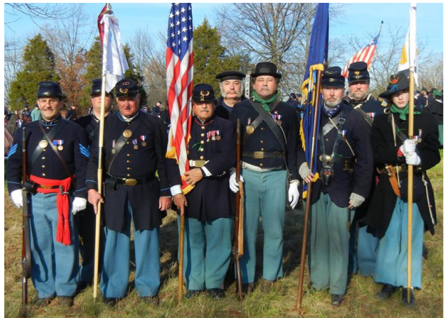
SVR, 14 th Michigan, Co A, parade participants at Gettysburg