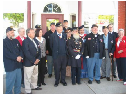
Some Allied Orders who were present

Consequently, for anyone who is interested in helping to support the hall (and also helping to replace the furnace), both Charter ($100) and General ($25) memberships are available. Thus far, SUVCW Austin Blair Camp #7, Curtenius Guard Camp #17, Benjamin Pritchard Camp #20, and George W. Anderson Camp No. 58; DUVCW Cornella Stockbridge Sheldon Tent #58; and the 13th Michigan Memorial Association have become Charter Members. Donations and memberships may be sent to GAR Memorial Hall and Museum at 224 South Main, Eaton Rapids, Michigan 48827. More information on the GAR Memorial Hall and Museum may be found by going its website located at http://garmuseum.com/ .