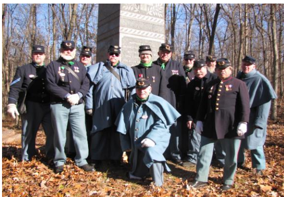
SVR at Neal Avenue SVR at Neal Avenue the Lost Avenue, Gettysburg