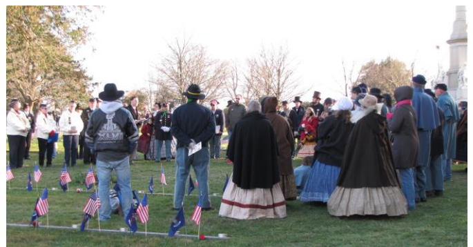
Michigan Remembers Gettysburg Memorial Service

Let us also not forget the importance of reporting G.A.R. Monuments. We need to publish these on our Department website. Please use the Form 61 for this reporting.