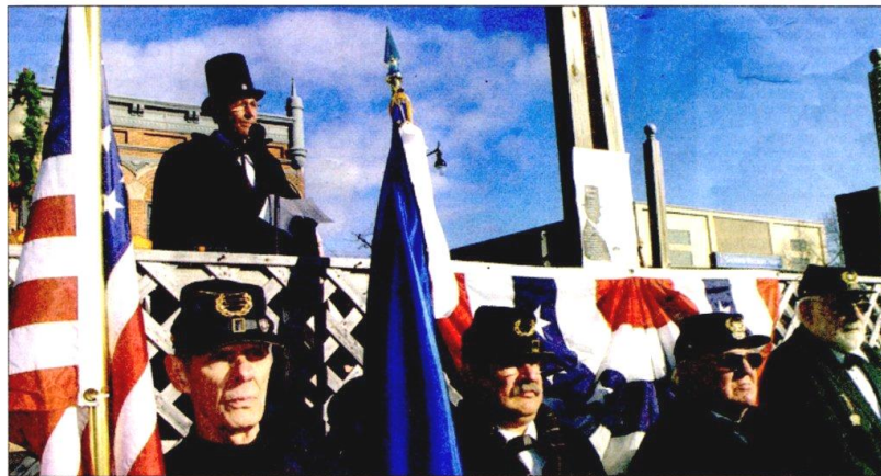
President Abraham Lincoln delivers the Gettysburg Address to hundreds of people gathered at Culligan Plaza in Alpena on Tuesday, while the Sons of Union Veterans Lockwood Post stand guard. For more photos from this event, log on to cu.thealpennews.com.