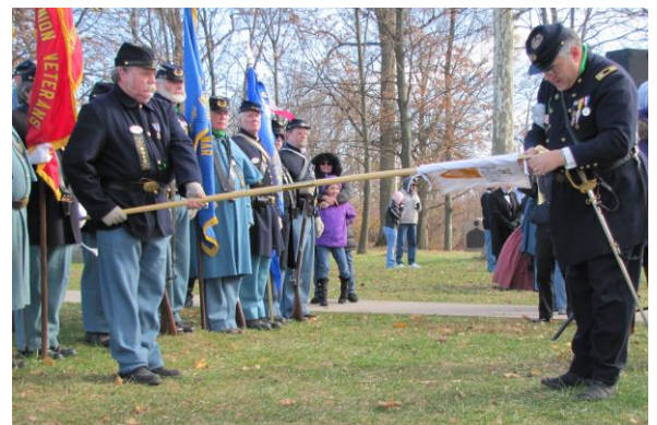
SVR Unit Citation SVR Unit Citation