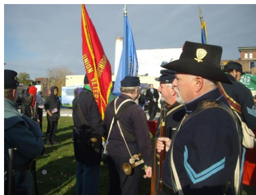
Camp 427 Members stage for the 2013 Detroit Veteran's Day Parade