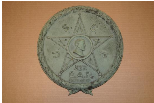
New York GAR Hall Plaque