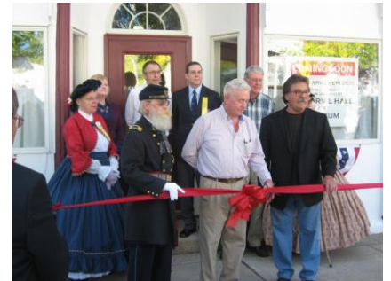
Grand Opening – Ribbon