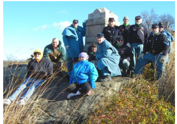
SVR at Sharpshooters Monument on Little Round Top