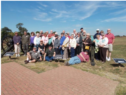
SUVCW/WMU ALL participants at Antietam