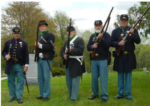
SVR Honor Guard

Several family members were in attendance for the occasion which included readings, reminiscences, and a photo and artifact display provided by family members. Members of U. S. Grant Camp 67 and Company A, 14 th Michigan Sons of Veterans Reserve supported the LeValley- Heusted Camp during the event. The Honor Guard fired a three volley salute which was followed by the playing of taps.