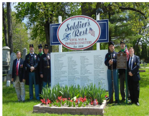
Soldier's Rest New Sign