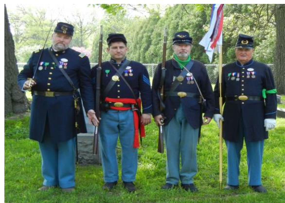
SVR/Grant Camp Honor Guard