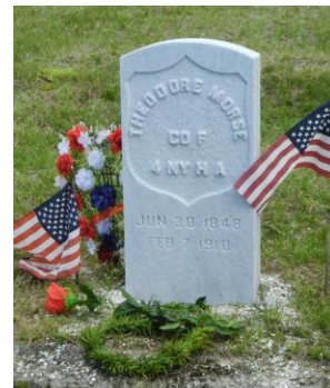
Headstone for Theodore Morse